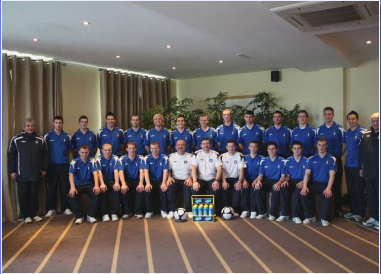
First Team Squad 2010